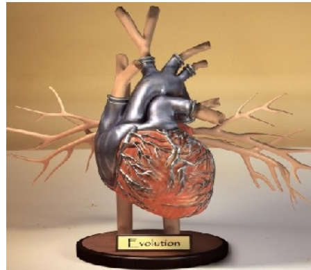
Figure 2. Image of Artificial Heart