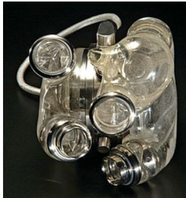
Figure 1. Photo of Artificial Heart