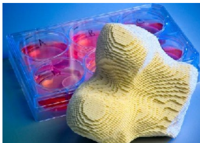
Figure 5. Artificial Bone