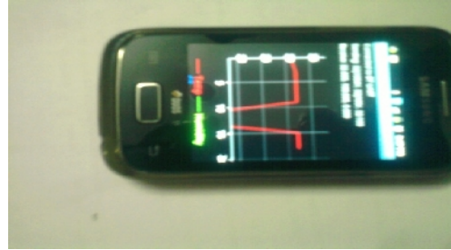
Figure 3. Temperature Graph