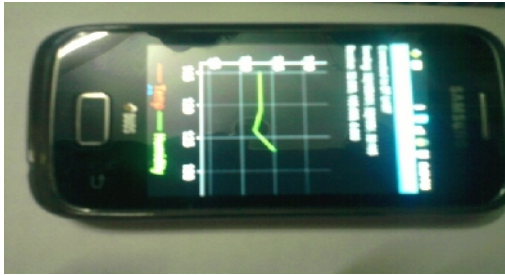
Figure 2. Humidity Graph